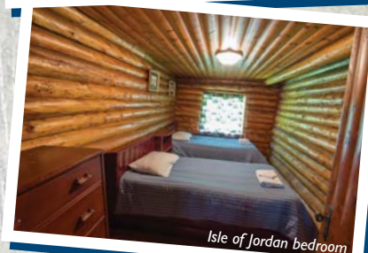
Isle of Jordan bedroom