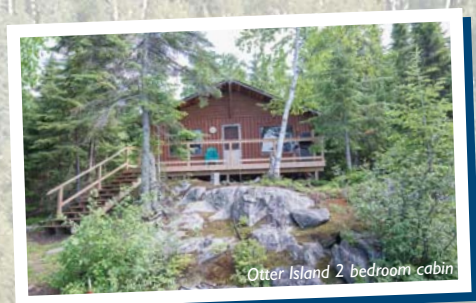
Otter Island 2 bedroom cabin