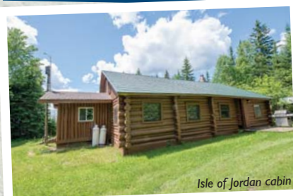
Isle of Jordan cabin