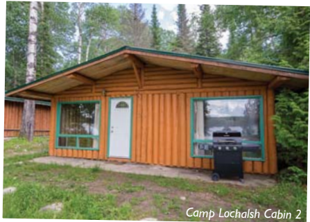
Camp Lochalsh Cabin 2

Crystal clear waters, untouched forests, fresh air, and deafening silence. Waters teeming with Walleye, Northern Pike, Whitefish, and Perch. This is Wabatongushi Lake, stretching over 22 miles in the heart of the Chapleau Crown Game Preserve, the largest in the World. The area is home to some of nature's most elusive animals such as Black Bear, Moose, Lynx, Bald Eagles, Loons, and Timberwolves. This is a place where the animals roam as they once did, naturally.