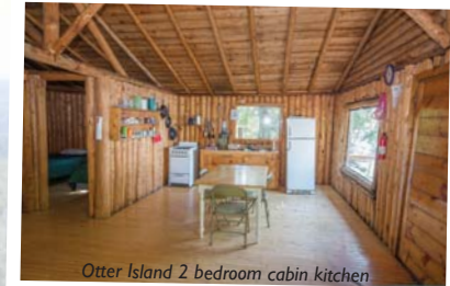
Otter Island 2 bedroom cabin kitchen