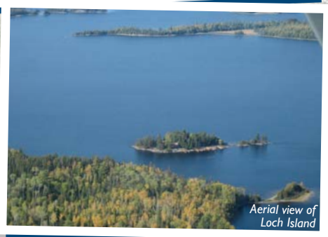
Aerial view of Loch Island